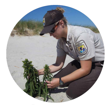
USFWS staff planting Seaside Goldenrod to improve Roseate Tern habitat

A backlog of 200 Comprehensive Conservation Plans (CCP) has also strained the System as funding for planning has largely been eliminated due to budget cuts. Planning is at the core of Refuge System management, but more than 60% of refuges have an outdated CCP or no plan at all. Increased funding for planning and management staff will allow the US Fish and Wildlife Service to begin to address this backlog and provide more of the tools it needs for active water management, habitat management and restoration, and invasive species eradication.