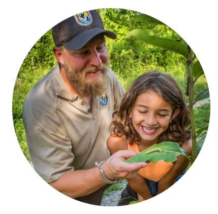
USFWS staff shows a young visitor a Monarch caterpillar on a leaf

Despite only minor increases in funding for the last 13 years, the Refuge System has added 18 new refuge units and hundreds of millions of acres of marine national monuments. It has also added new services, such as the Urban Wildlife Conservation Program launched in 2012 that seeks to address inequalities in recreational access and conservation participation. This program has dramatically changed the way conservation is delivered to communities, and visitor numbers have grown to over 67 million visitors a year--an increase of 36% since FY2010. While the additional acreage, the creation of the urban program, and the increased visitors have enhanced the Refuge System and benefited the communities around these refuges, this growth has also put more pressure on the already stressed and underfunded System.